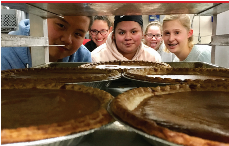
Teen Team baking pies.

Teen Team collectively performed 378 community service hours in 2019, including but not limited to events like the annual Midnight Run, partnering for the second year with 10 Hotchkiss students to bake 56 pies for the Millerton food pantry, and supporting local organizations like the Northeast Millerton Library and the Harlem Valley Rail Trail Association.