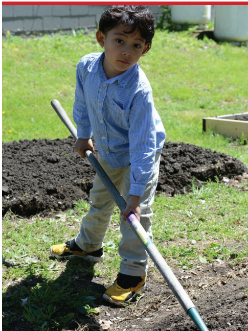
Young volunteer working hard in the school garden at Webutuck School.