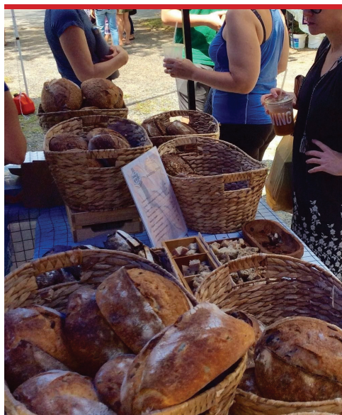
Farmers Market bounty on a summer day.

NEDT made a total of 2,957 trips and served 296 seniors and people with disabilities get to medical and other appointments. NEDT also provided regular shopping trips to Walmart once a month.