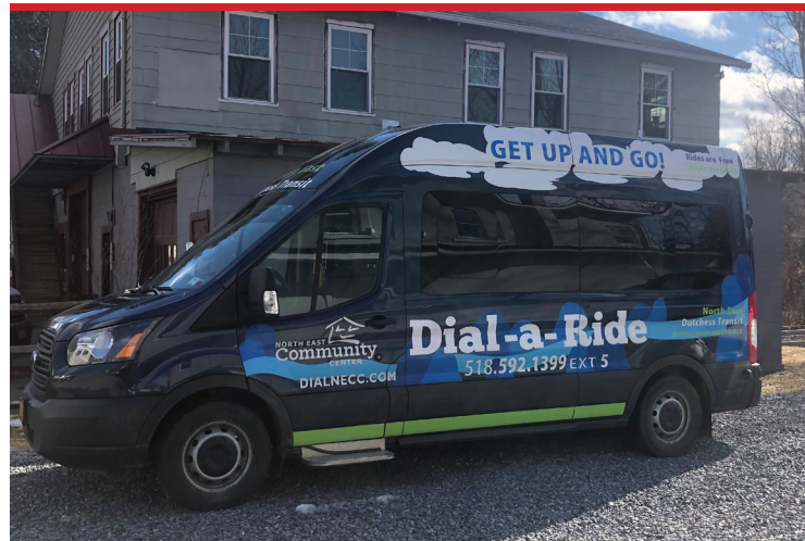
NEDT van ready for a day on the road.