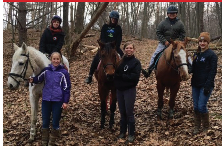
Healthy Empowered Youth kids on horseback.

33 Teens worked at 19 local worksites, completed 5,930 intern hours and attended 226 hours of paid work-skills trainings which included interpersonal communication, financial literacy, public speaking and college essay writing 101.