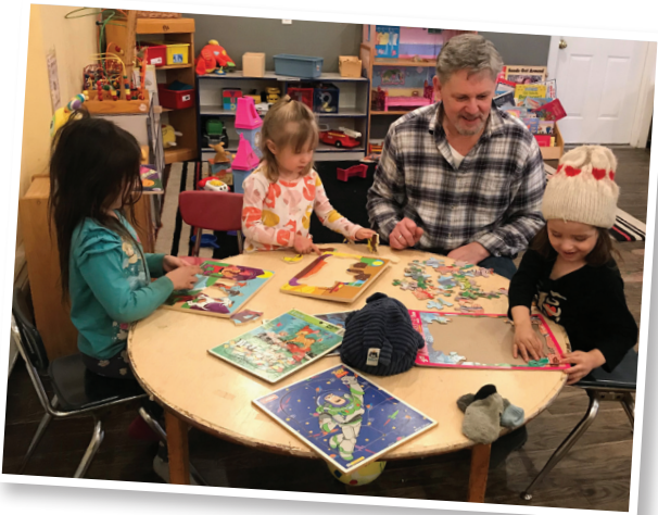
Photo: Toddler program

"Embracing the enhanced cooperation with our regional neighbors in Amenia and Pine Plains, the North East Community Center co-hosted with Hudson River Housing a housing conversation in April of 2019, formed an ad hoc Tri-Town Coalition, and held several monthly meetings. With little money or staff but several volunteers for the project, we are playing a significant role addressing the housing deficit in the whole northeast corner. I am so impressed by the NECC Director and staff, our resourcefulness and our emboldened partners. We will surely identify a way forward. What an honor to witness the continued growth!"