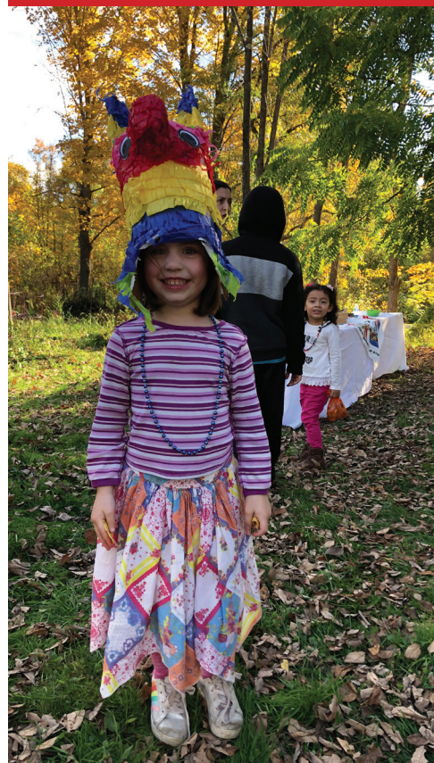
Child enjoying the pinata at the NECC Hispanic Heritage Festival.

Worked with 70 children from 60 families in our After School Connections Program, which provided a safe, healthy and creative environment to learn and play.