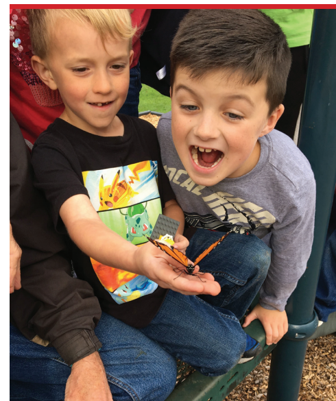
An exciting moment during the After School butterfly release.

The Summer Lunchbox program prepared 4,100 free breakfasts and lunches for children from the Webutuck School District over 7 weeks during the summer.